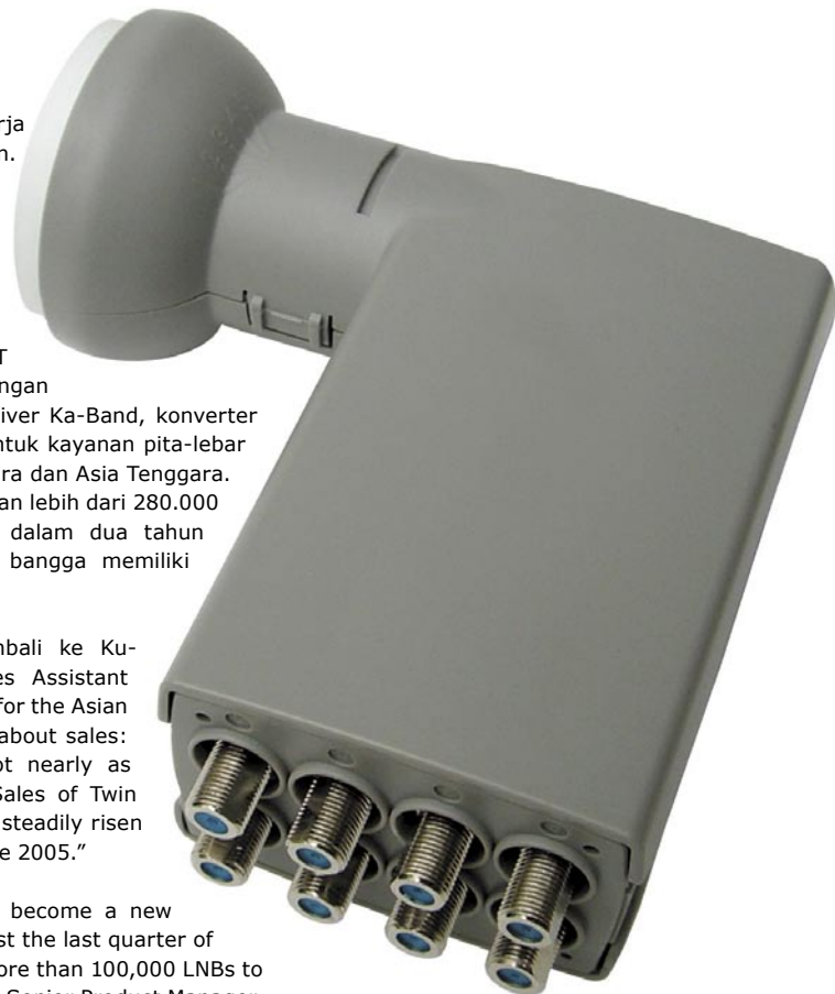
One of MTI's latest innovations is this Octo LNB

MTI presents itself as a company that certainly lives up to the name of the street: Innovations for more than 24 years have placed MTI at the head of the class.